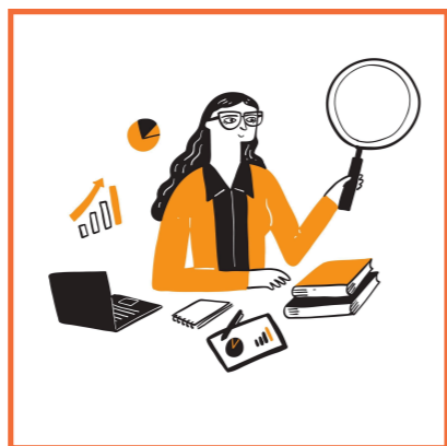
Capstone & Live Projects