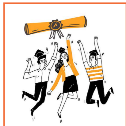
Internships & Co-op Work Placements

How best to keep up with the demand for all-rounded talent to join our team? WiseSpot takes on an active approach to talent development. Other than regularly offering our own