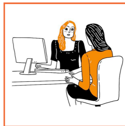
Work-Integrated Learning & Mentoring

software development internships as well as trainee programs, WiseSpot also supports Hong Kong's higher education institutions and training providers with their work readiness initiatives.